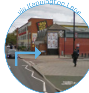
via Kennington Lane