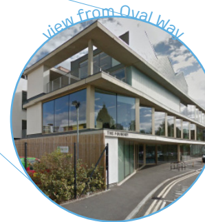
view from Oval Way