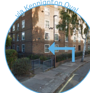
via Kennington Oval